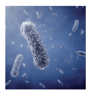
Laboratory certified 99.99% bacteria-free Every Borg & Overström appliance undergoes an anti-microbial, antipathogen, sanitising procedure. The reassurance of hygienically safe appliances is provided by the unique bacteria-eliminating process, Sterizen™.