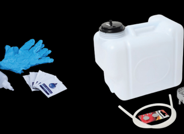
Six monthly sanitising cycles ensure appliances function at the optimum hygiene levels.