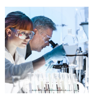
Driven by a relentless pursuit of excellence, Borg & Overström Totality™ is a research and development methodology for the advancement of hygiene, innovation and technology in refreshment systems.